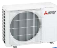
Only 699mm width

Compared to other models, width is down by 16%.